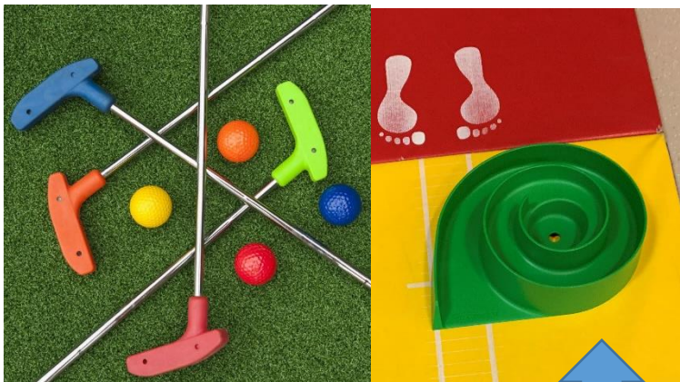
One of the Golf Obstacles

I can demonstrate offense and defense strategies in modified badminton games